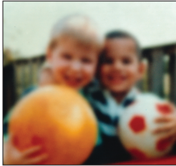
The same scene as viewed by a person with cataract